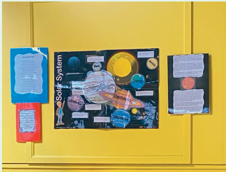
Montessori Solar System